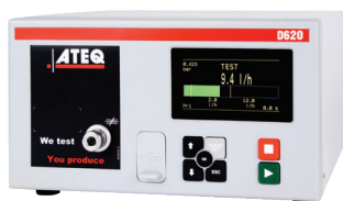
D620 Compact Case