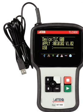
TLC 600 Remote control